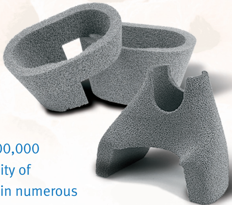
Trabecular Metal Cone Augments

Clinical experience in over 200,000 cases has proven the versatility of Trabecular Metal Technology in numerous orthopaedic applications. 3